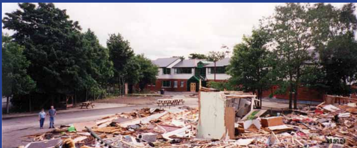
Our new school building looks out on the ruins of the original school, demolished in July 1999

Board of Governors of Oakgrove Integrated Primary School and Nursery September 2015 - August 2016